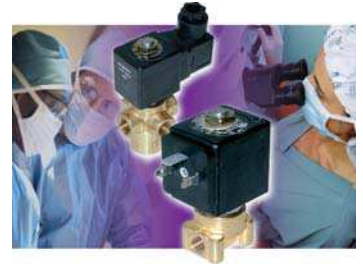
Medical / Instrumentation